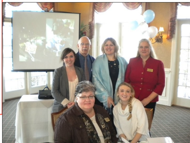
The United Way staff takes a break to smile for the camera!