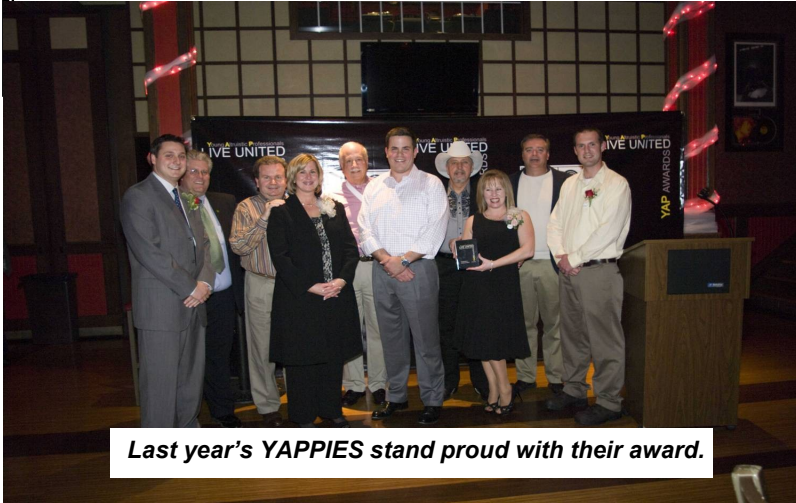
Last year's YAPPIES stand proud with their award.

Come join us and support this year's nominees and the United Way of Ocean County. Tickets are $25 and can be purchased by cash or check at the door or in advance by calling 732-240-0311. Enjoy a beer and wine open bar from 6:00 - 7:00 p.m. and delicious Hemingway's hors d'oeuvres. You can also enter to win the 50/50 raffle or participate in the Gift Auction.